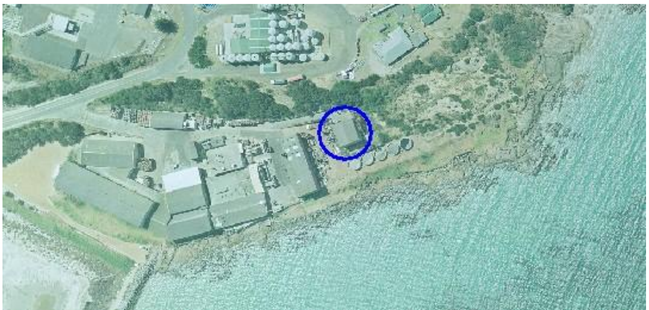
Figure 3 Nearest Noise sensitive Premises (Industrial)

From the above circles and the town planning map (Figure 4) we calculate a maximum allowable noise level of 45 to 46 as explained in the following section (Criteria).