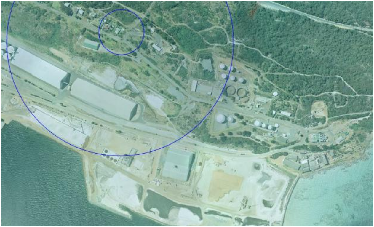
Figure 2 Nearest Noise sensitive Premises (Residential) and Influencing Circles

From the above circles and the town planning map (Figure 4) we calculate a maximum allowable noise level of 45 to 46 as explained in the following section (Criteria).