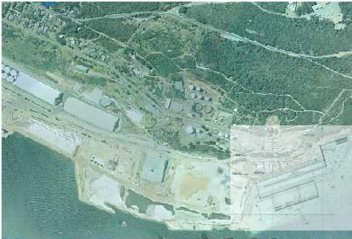
Figure 1- Position of the Proposed Port operations (shown bottom right)

Note the port operations layout is shown in more detail in Appendix A