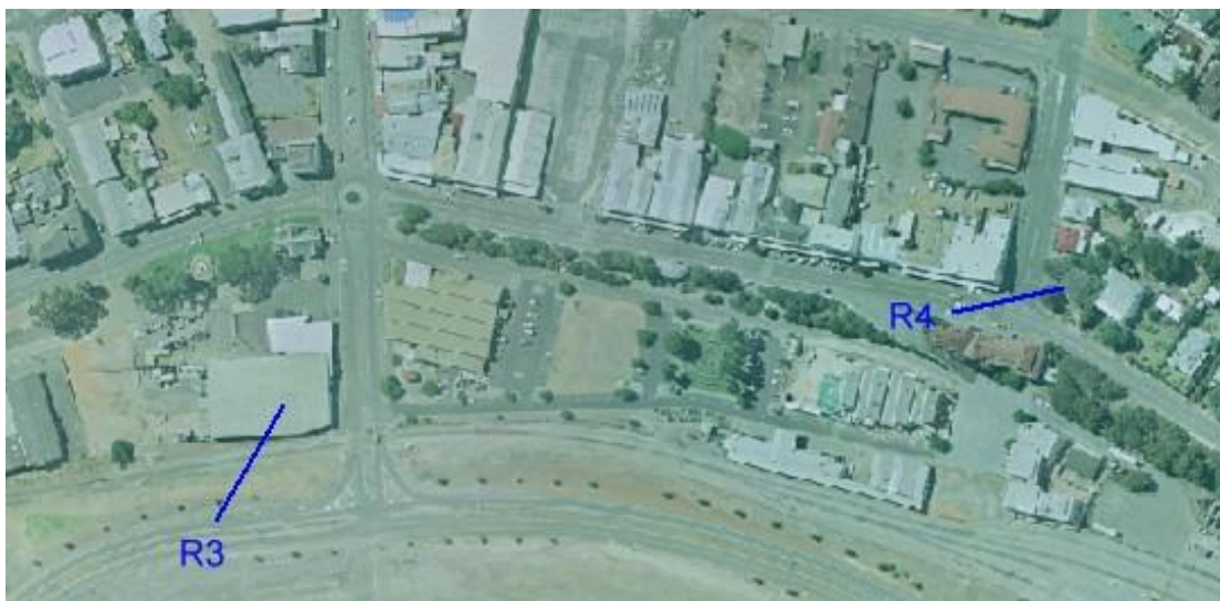
Figure 4 – Location of the nearest noise sensitive premises to S1

For the noise source S1, Figure 4 shows the location of the nearest commercial noise sensitive premises (R3) and residential noise sensitive premises (R4)