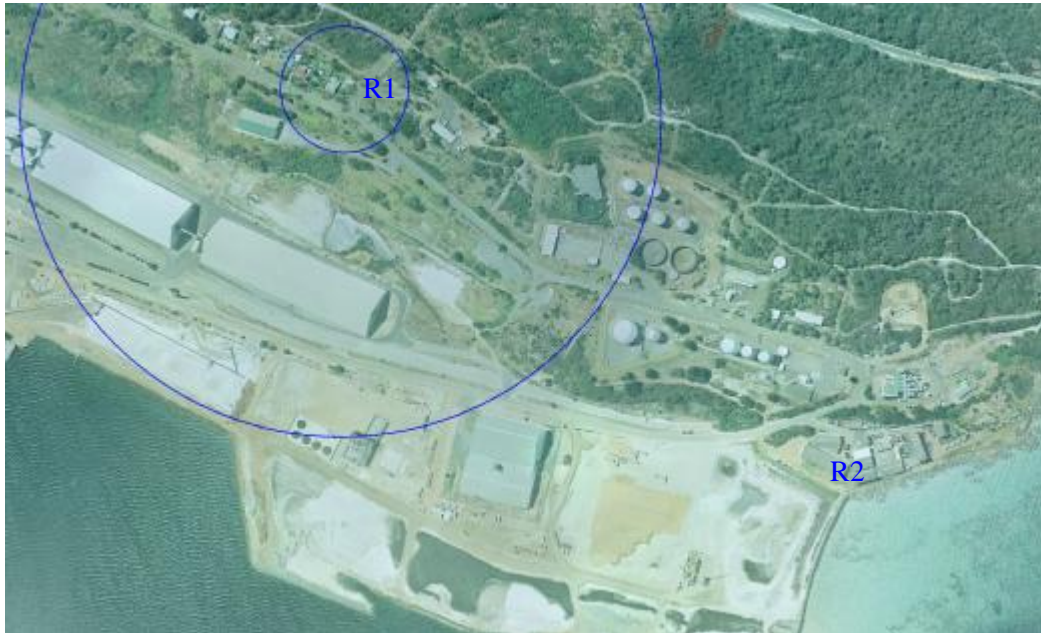
Figure 3 Location of R1 - nearest residential noise sensitive to S2

For the noise source S1, Figure 4 shows the location of the nearest commercial noise sensitive premises (R3) and residential noise sensitive premises (R4)