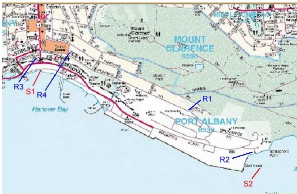
Figure 1 - Plan of the Proposed Developments and nearest residences.

Figure 2 shows an aerial view of Source 2 together with the assumed position of the major noise sources. For the purpose of this analysis the noise sources are assumed to act along the lines indicated (construction crane along line A-A', dozer along C-C' etc) with the haul trucks acting along A-A'.