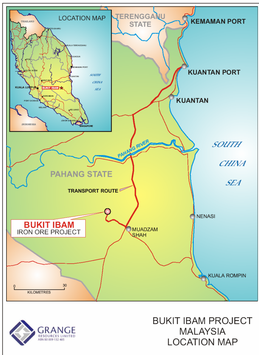
Figure 2. Location of Bukit Ibam project

The Bukit Ibam Project is located at the former Bukit Ibam iron ore mine, in Pahang State, Malaysia (see Figure 2). The mine operated from 1962 and produced approximately 22 million tonnes of haematite and magnetite ore before closure in 1970. Grange Minerals Sdn Bhd, a wholly owned Malaysian subsidiary, holds 51% project equity in a joint venture with a privately owned Malaysian mining company, Esperance Mining Sdn Bhd.