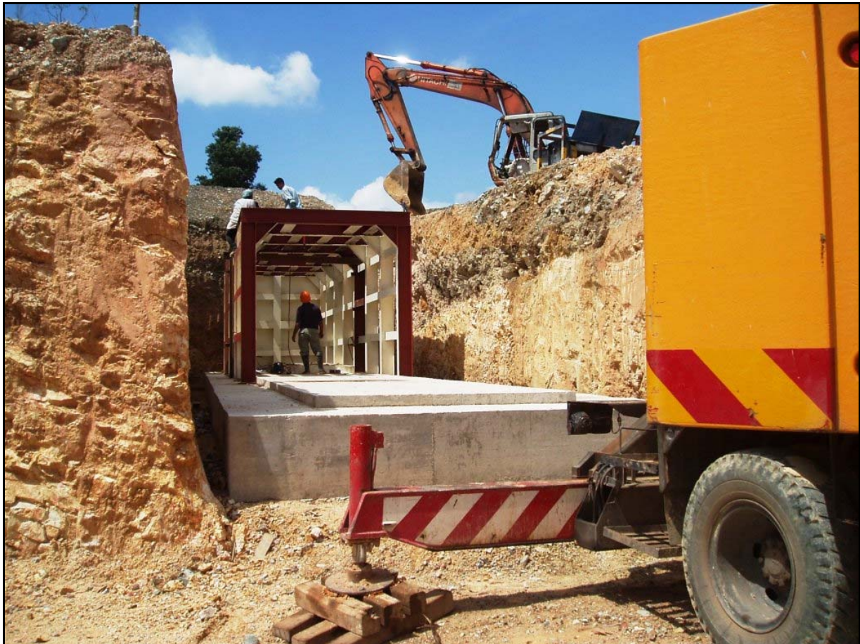
Figure 4: Installation of the Reclaim Tunnel at the Bukit Ibam plant site

In June 2008, Grange Minerals received approval from the Department of Forestry in Pahang to extract and process iron ore tailings located in a Forest Reserve Area (see Figure 5) and to rehabilitate the area in the process. The tailings were generated during mining operations between the years 1962 to 1970 and are contained in a storage dam located 1.5kms east of the plant being constructed at Bukit Ibam. This is an important step in establishing a 'tailings re-treatment' project which has the potential to significantly increase the production capacity of the current project at minimal cost.