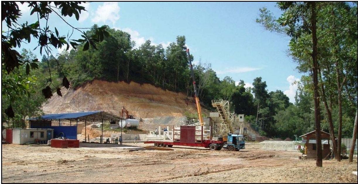
Figure 3: Steelwork being delivered to the Bukit Ibam plant site